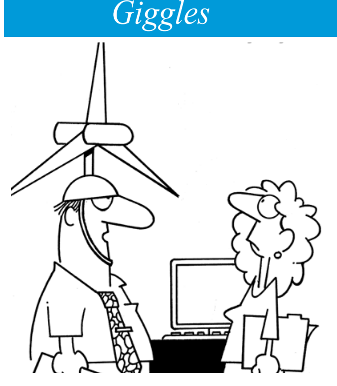
"Wind may be the energy source of the future, but it's a poor substitute for coffee."

Phone: 515-226-7605 Fax: 515-223-9301 ccorwin@bryton.com